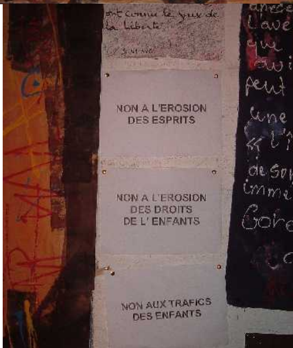
House of the Slaves, Gorée, Dakar, 2008