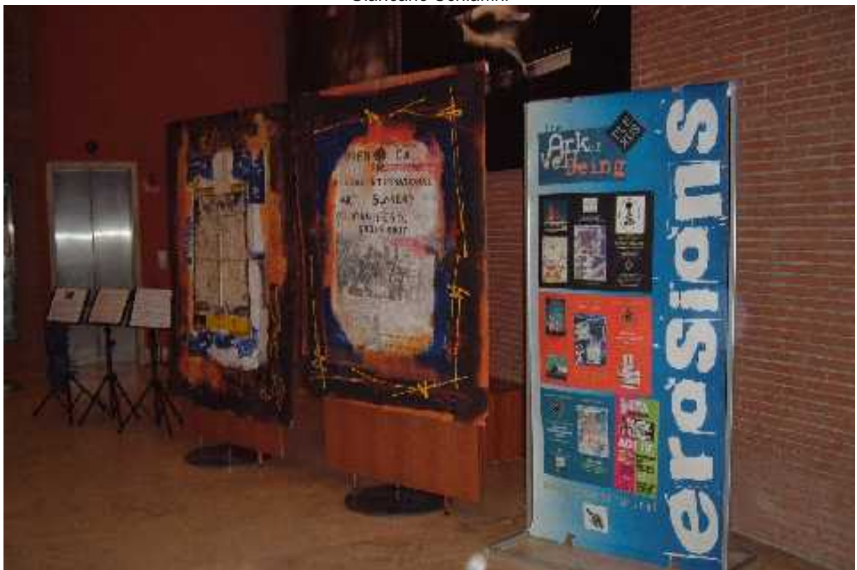
Parco della Musica, Rome 2008