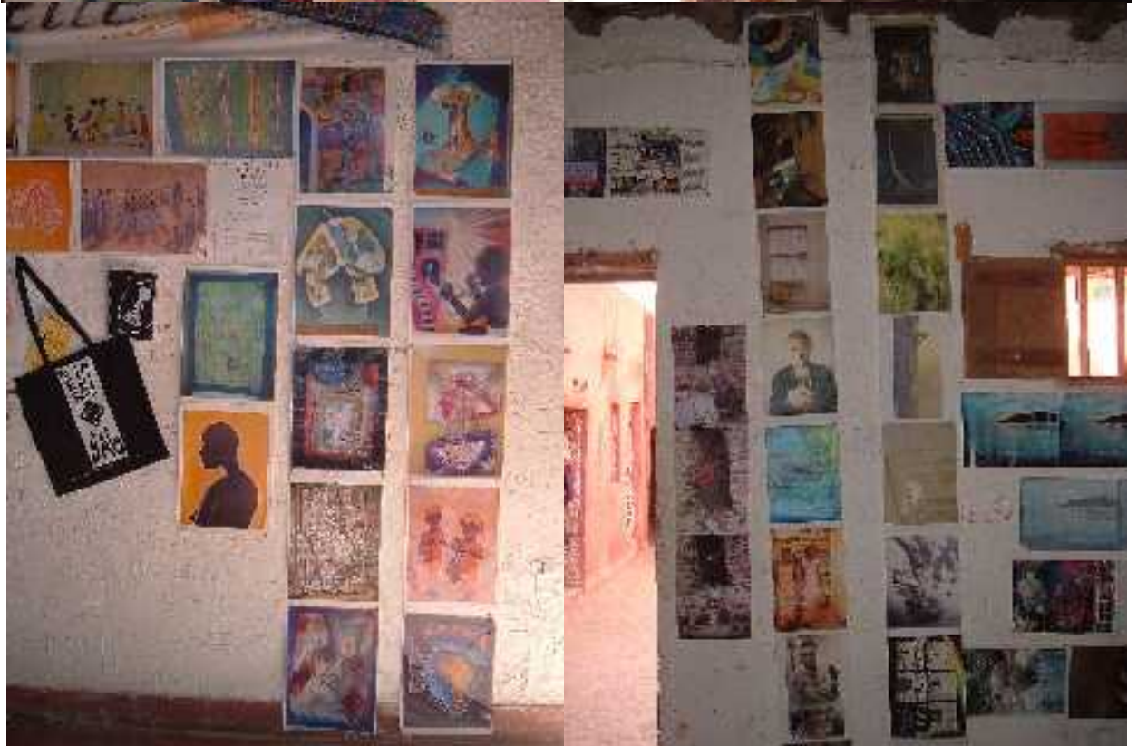
House of the Slaves, Gorée, Dakar, 2008