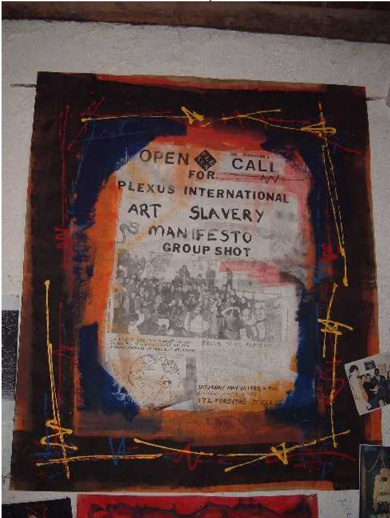
Artwork by Seni MBaye, House of the Slaves, Gorée, Dakar, 2008