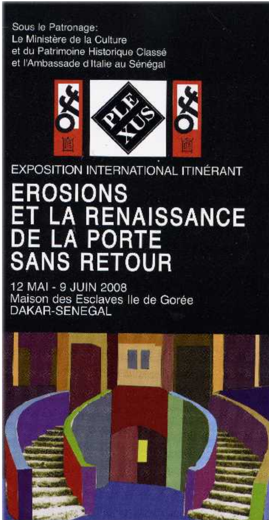
House of the Slaves, Gorée, Dakar, 2008