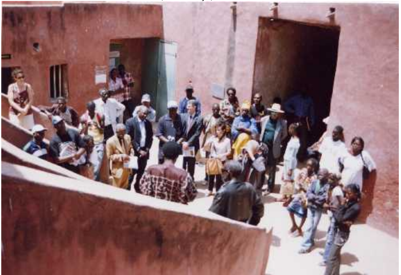
House of the Slaves, Gorée, Dakar, 2008