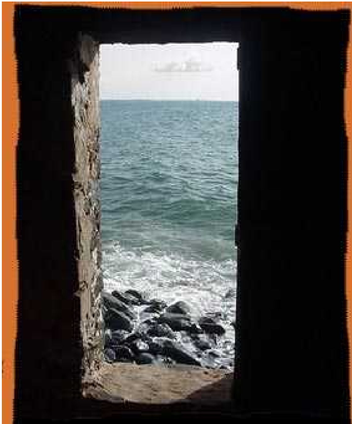
House of the Slaves, Gorée, Dakar 2008

From May 12 to June 9 of 2008, at the House of the Slaves of Goree, within the DakArtOff of the Biennale of Contemporary African Art of Dakar, it was held the art exhibition Erosions and Renaissance Show Act 8 with the Patronage of the Minister of Culture and of the Embassy of Italy in Senegal. All 418 reproduction of the digital art contributions arrived to the Plexus Virtual Gallery from artists around the world were exposed. At the end, the Call of the Door of No Return to Safeguard the Natural and Cultural Heritage of the Humankind was issued, requesting also the development of a specific plan to preserve the House of the Slaves from the increasing sea erosion.