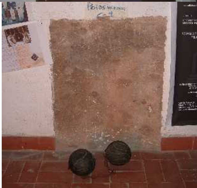
House of the Slaves, Gorée, Dakar, 2008