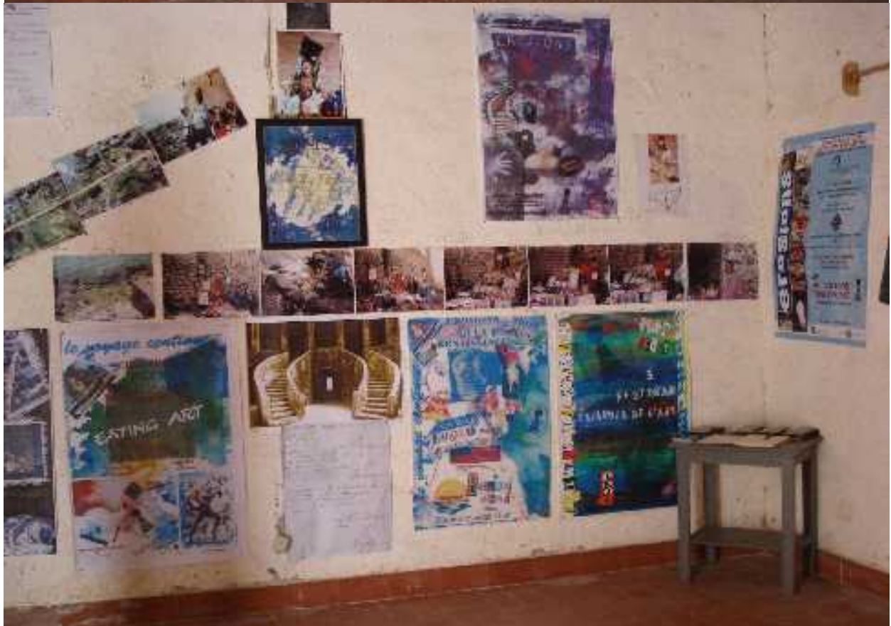
House of the Slaves, Gorée, Dakar, 2008