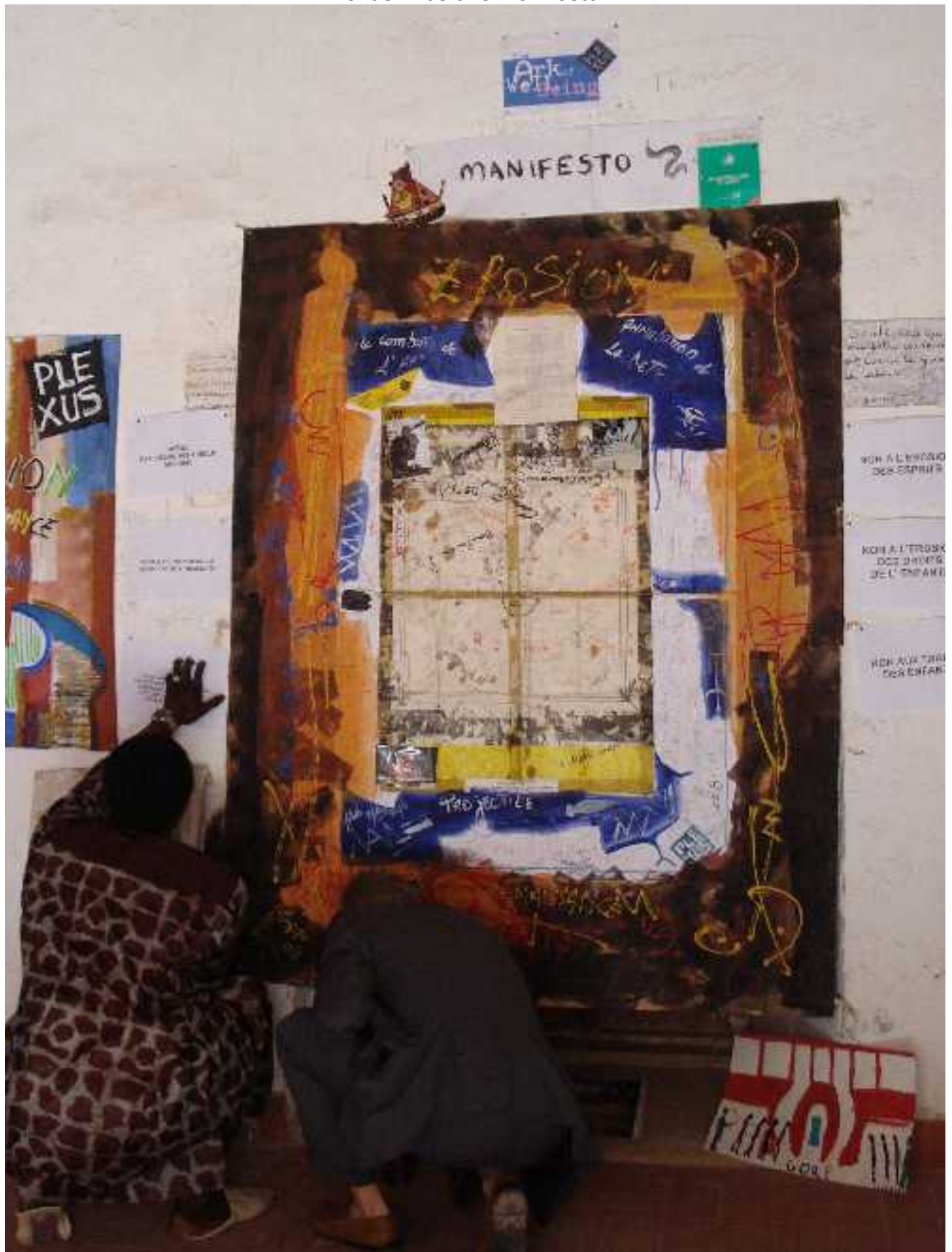
Artwork by Seni Mbaye, House of the Slaves, Gorée, Dakar, 2008