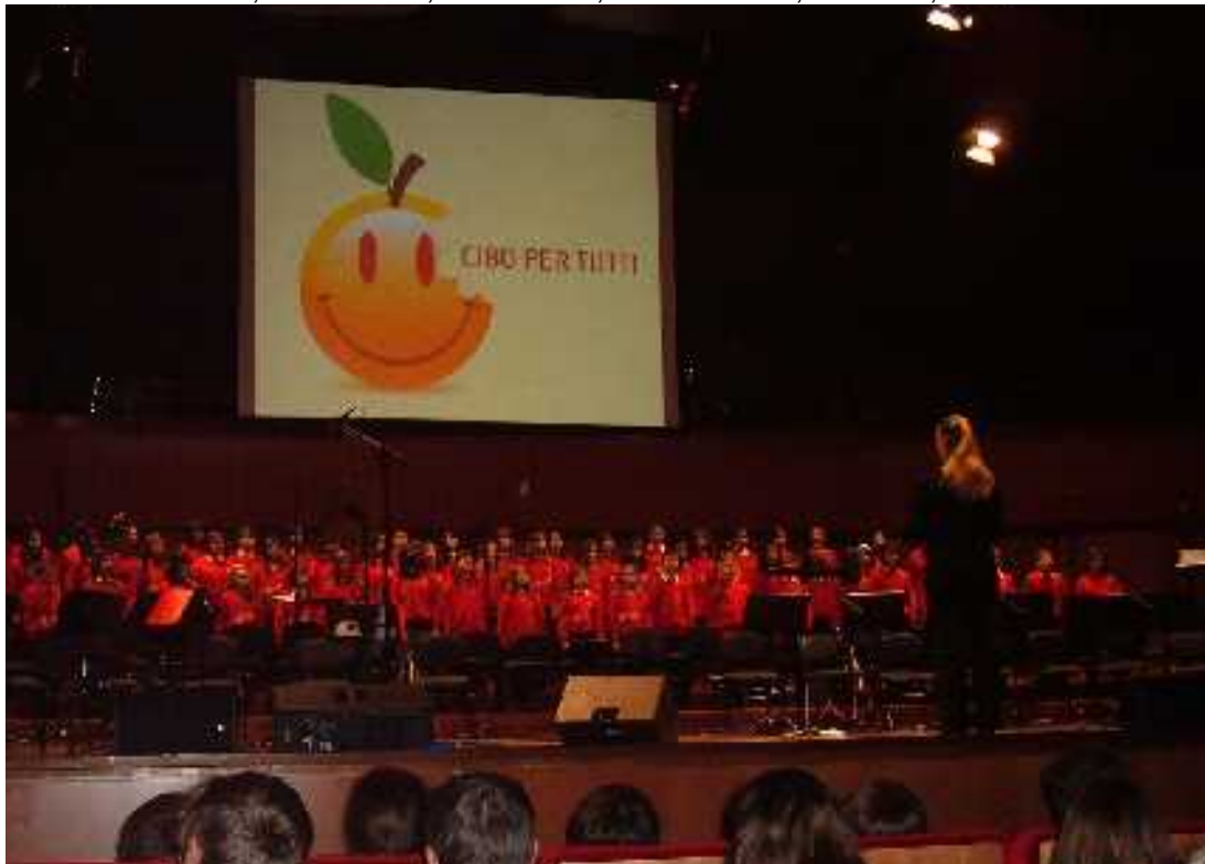
S. Cecilia Academy Arcobaleno Chorus, Parco della Musica, Rome 2008