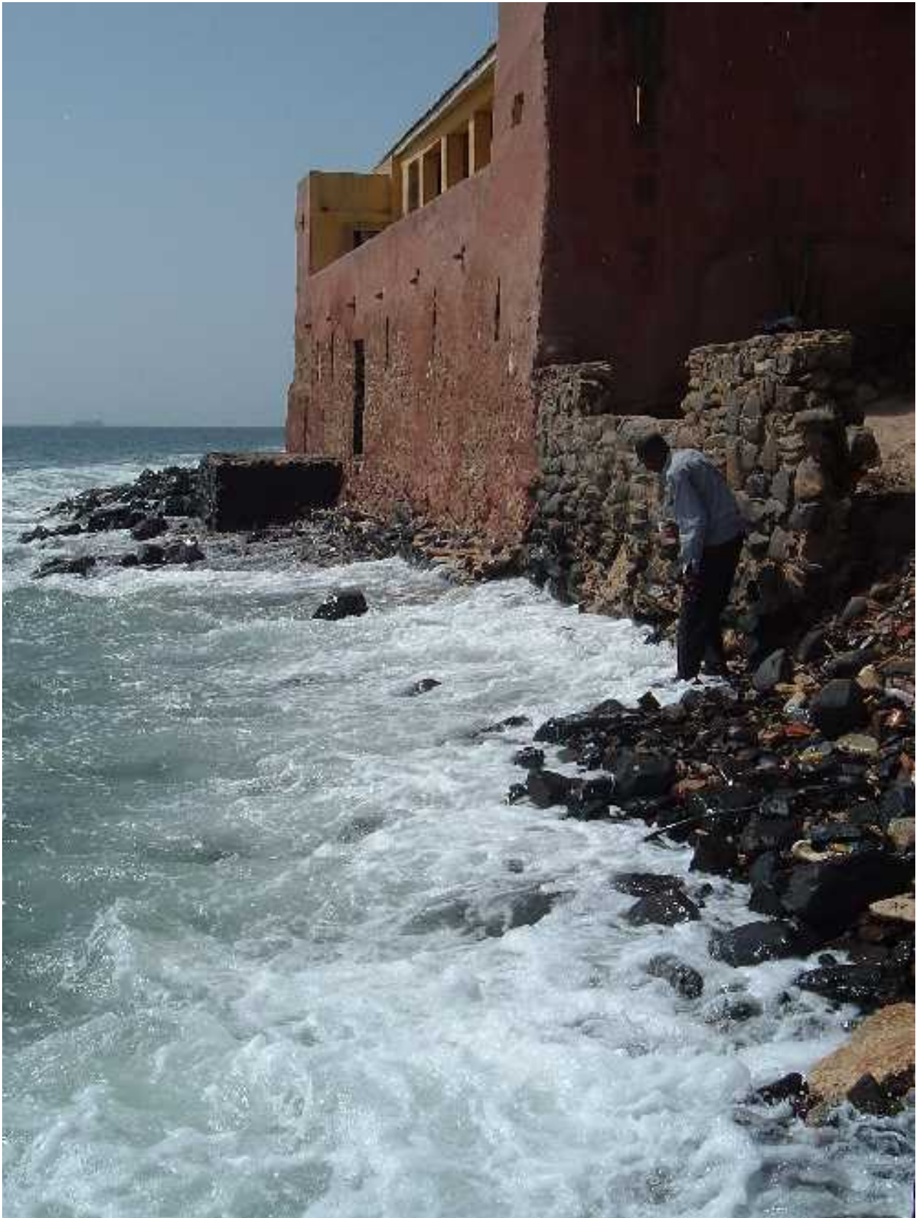
House of the Slaves, Gorée, Dakar 2008