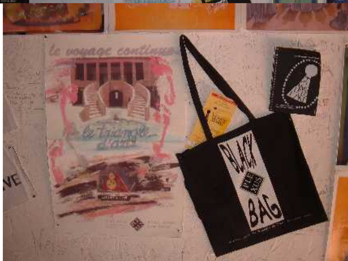
House of the Slaves, Gorée, Dakar, 2008