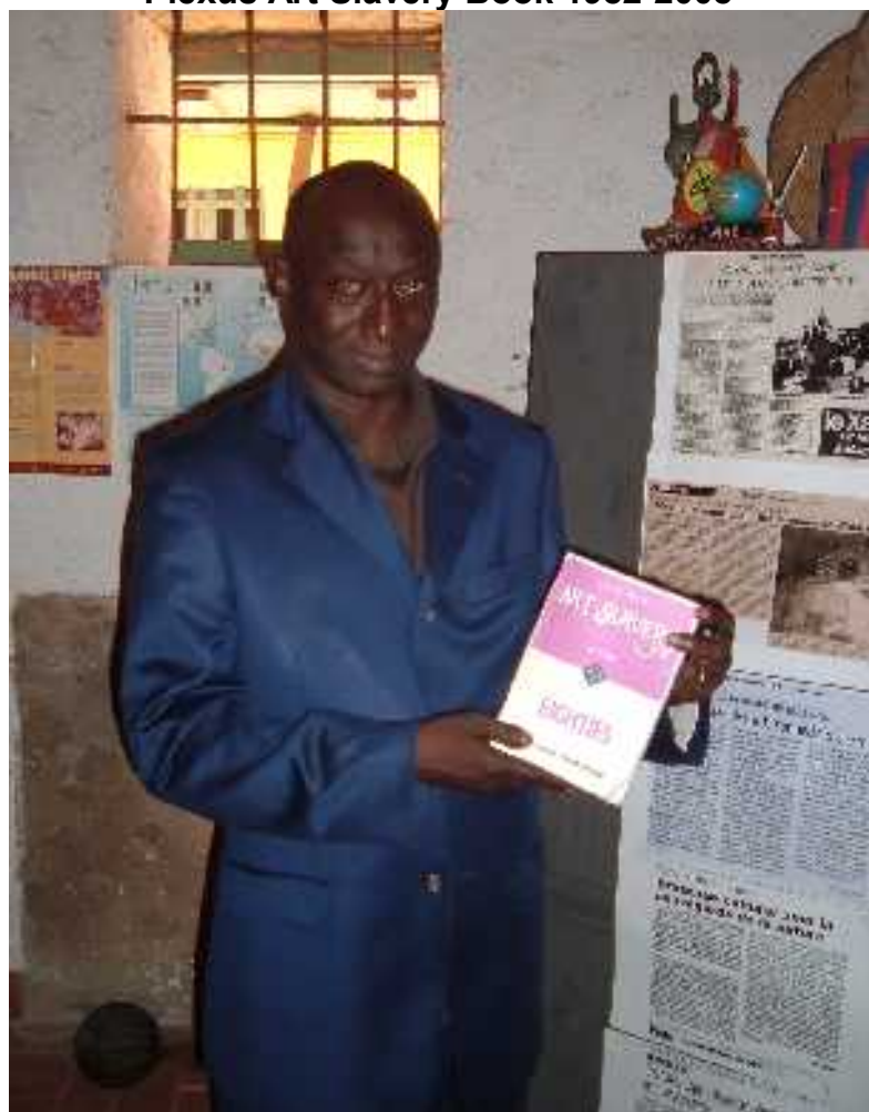
Minister of Culture Mame Birame Diouf