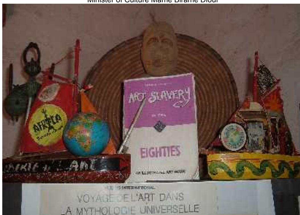
House of the Slaves, Gorée, Dakar, 2008