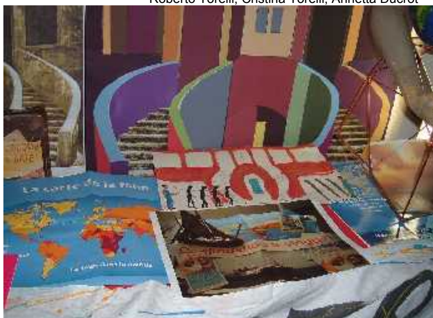
Stardust, Rome 2008