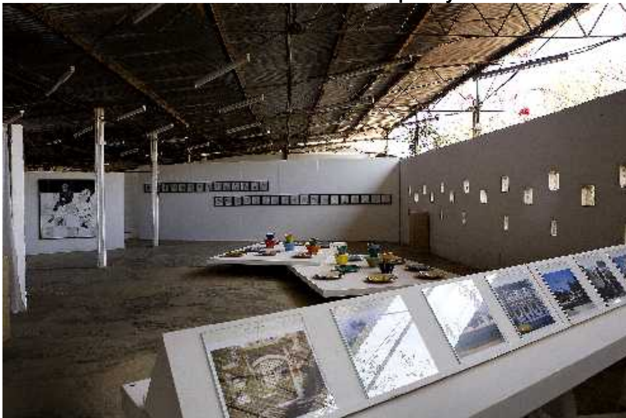
Ateliers Céramique Almadies