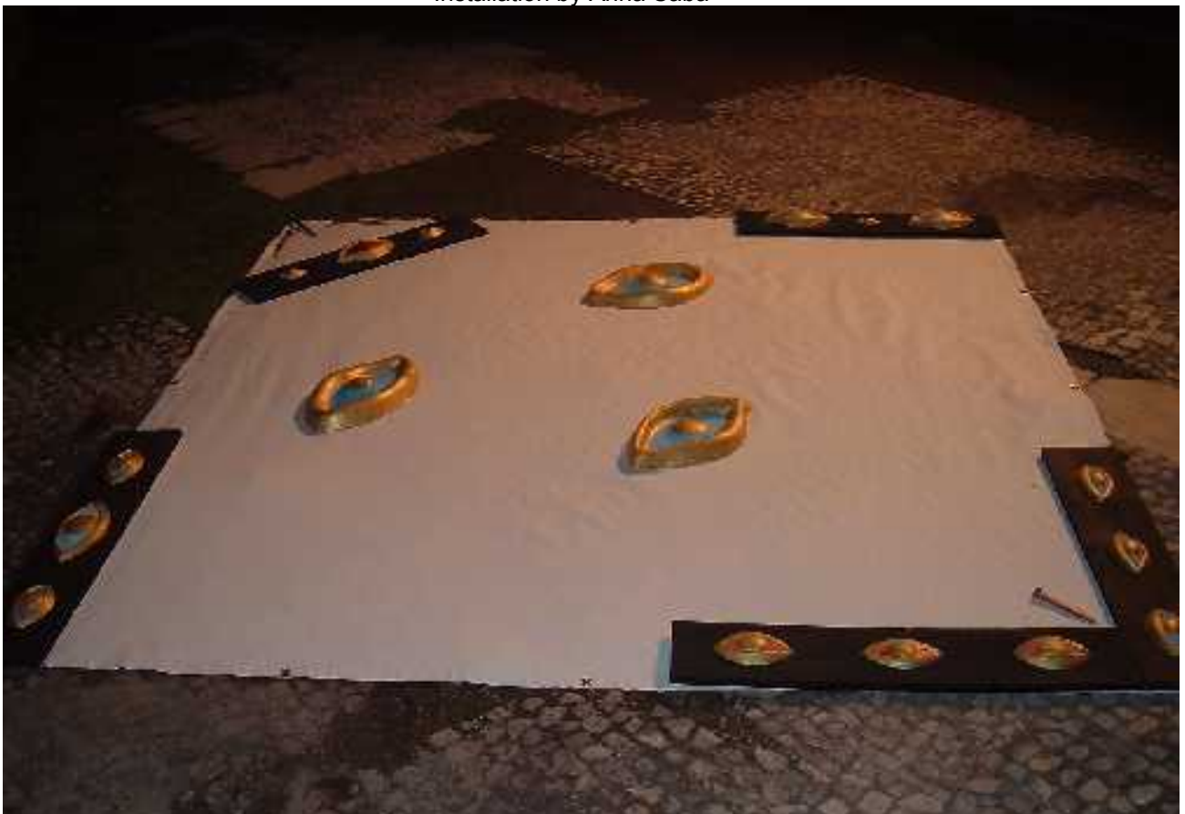
Installation by Giorgio Fiume, National Academy of Dance, Rome 2005