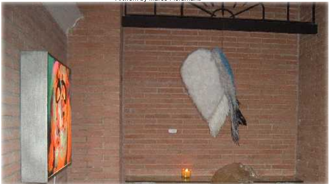
Installation by Eleonora del Brocco, National Academy of Dance, Rome 2005 The Ark of the Well Being: Eating Art