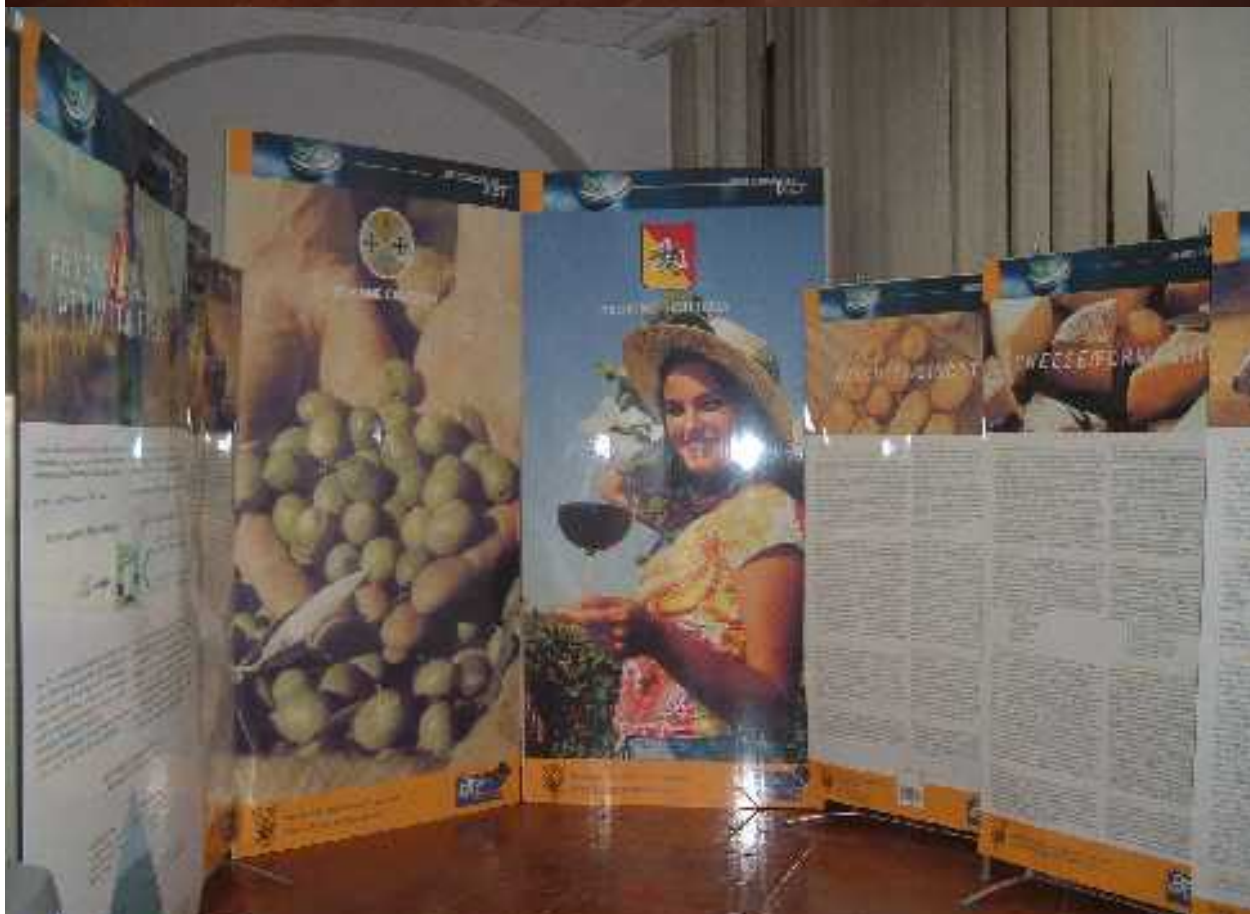
National Academy of Dance, Rome 2005