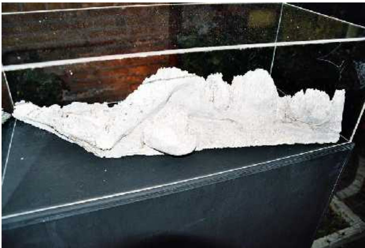
Artwork by Venera Finocchiaro