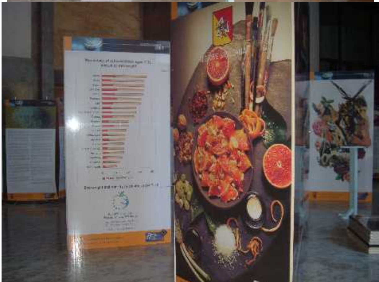
Rector Hall, University Sapienza of Rome 2005