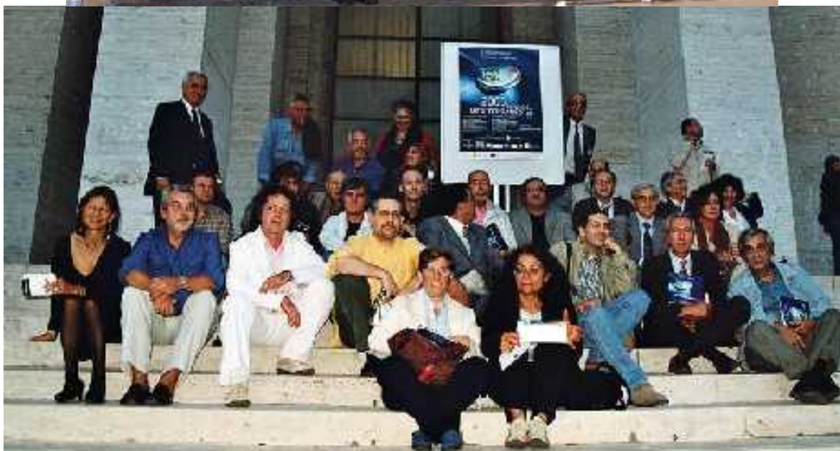
Rector Hall, University Sapienza of Rome 2005