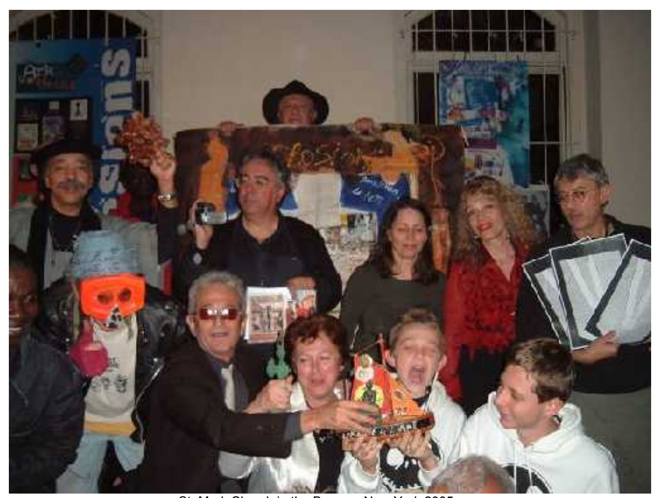
St. Mark Church in the Bowery, New York 2005