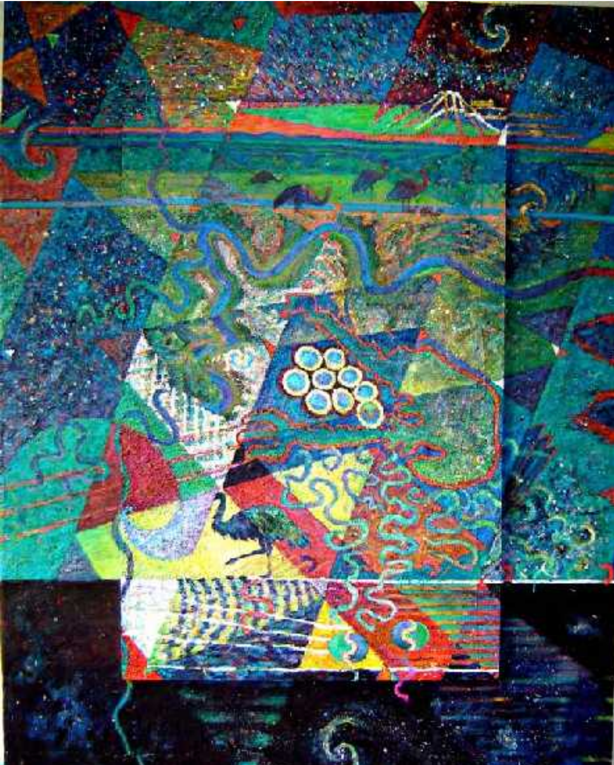
Artwork by Geoff Buchan, Australia 2004

On November 29 - December 5 of 2004, at the Grainery Lane Theatre Gallery, in Ballarat, Australia, on the occasion of the Eureka 150 Rising Rebel Festival by Culture Lab International, 147 digital artworks were collected online and their reproduction exposed as 2° Act of the Erosions Show. It was made to raise attention on the erosion of a sacred Aboriginal ground in the Maroota Plateau, within the Blue Mountains.