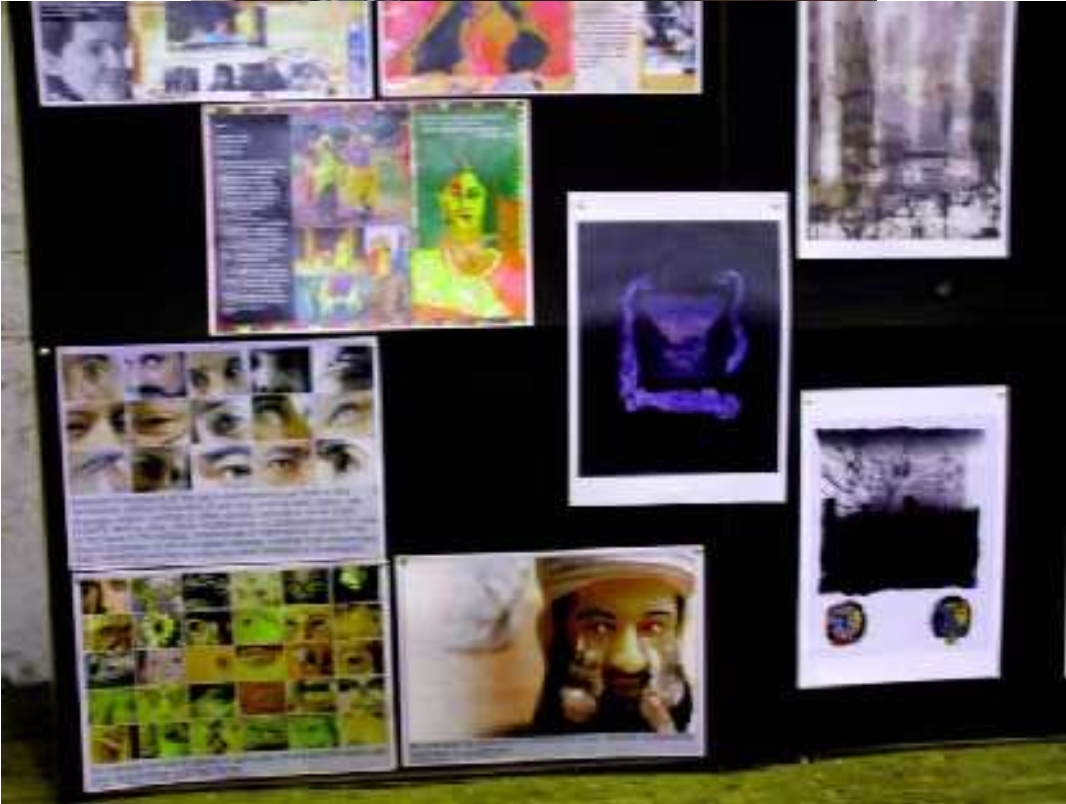
www.plexusforum.net. Grainery Lane Theatre Gallery, Ballarat, Australia 2004