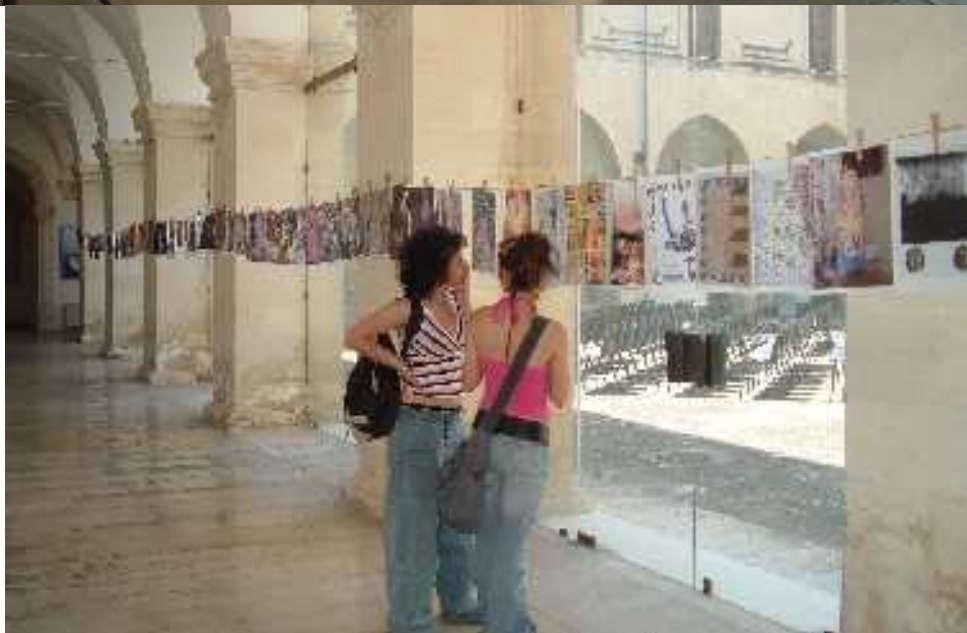
Academy of Fines Art , Lecce, Italy 2005