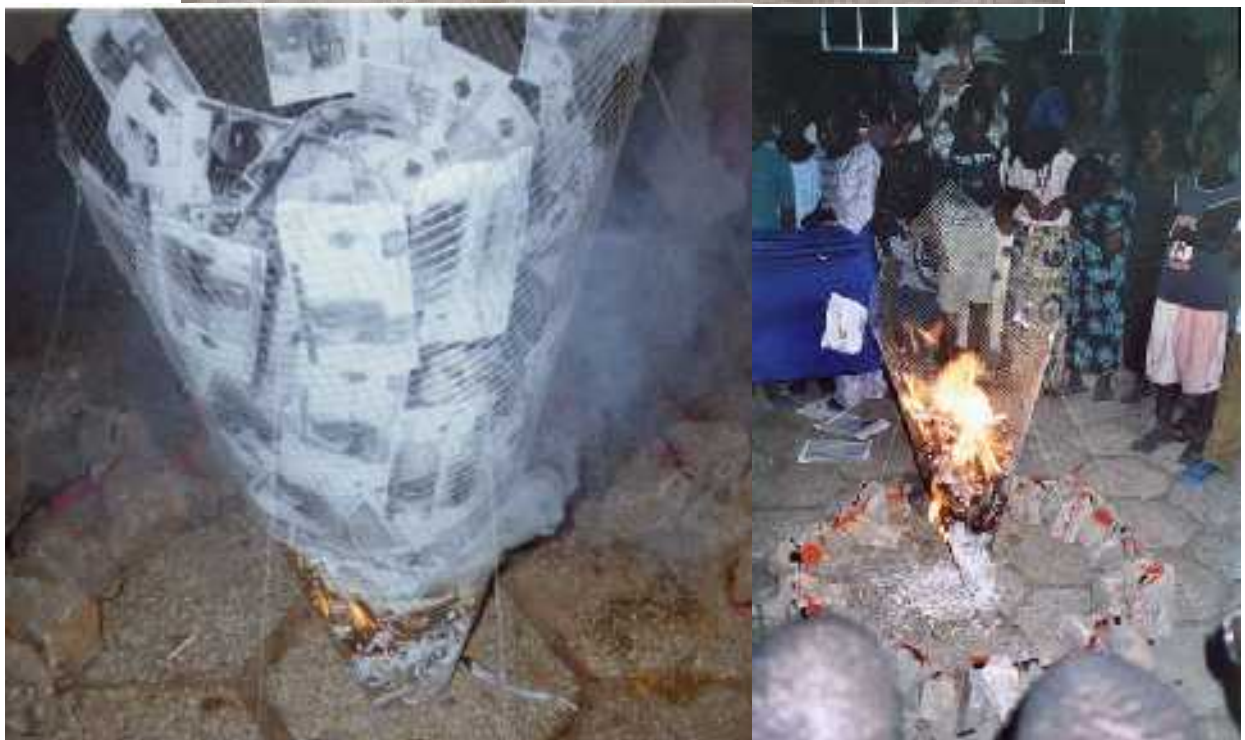
Art installation by Micaela Serino, Municipality of Medina, Dakar 2002