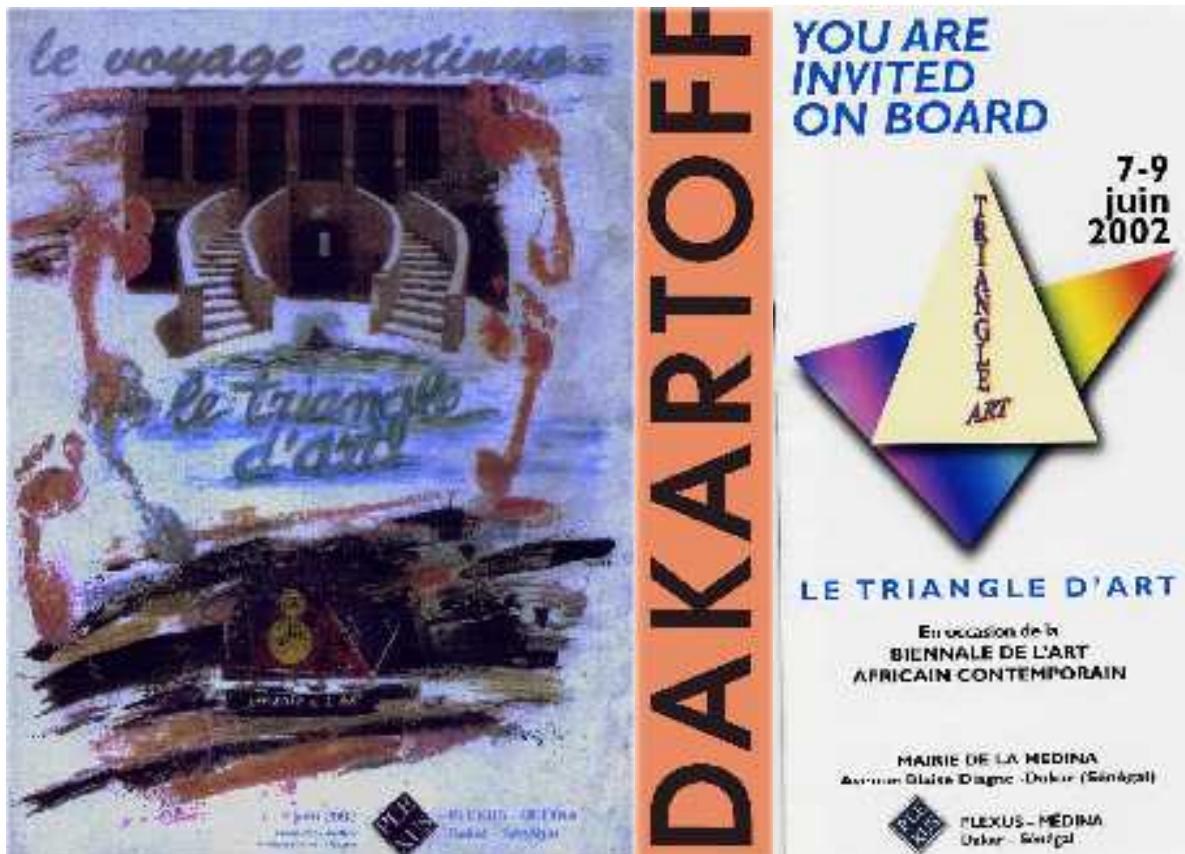
Poster by Luisa Mazzullo