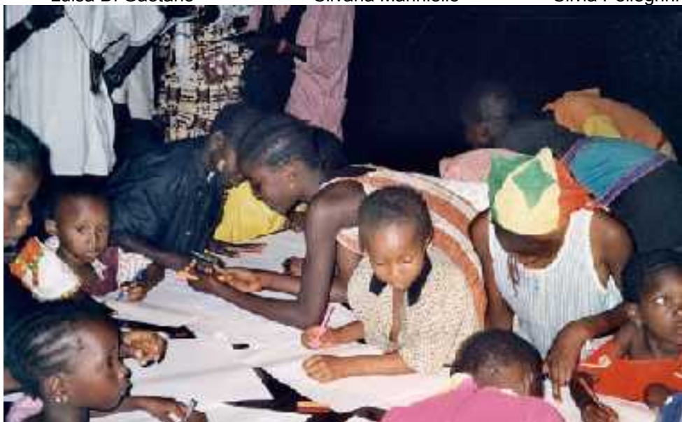
Plexus Atelier des Arts for Children, Municipality of Medina, Dakar 2002