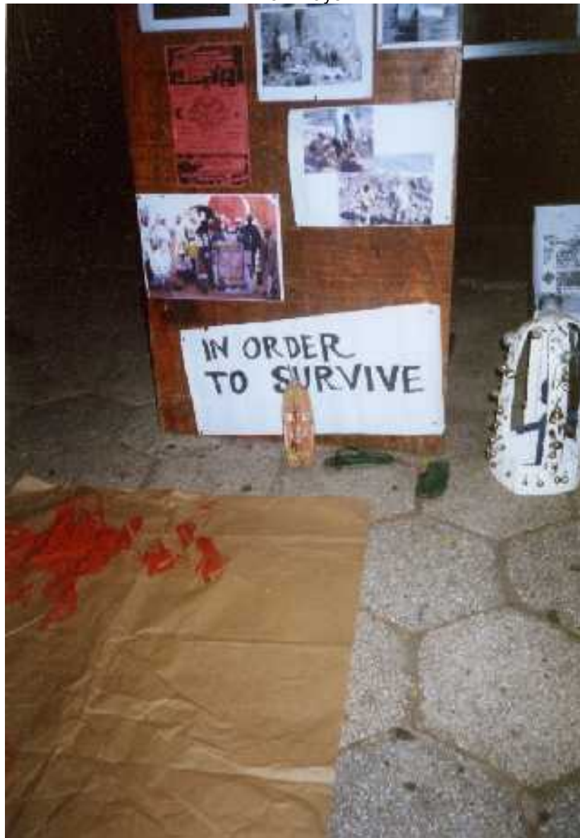
Municipality of Medina, Dakar 2002