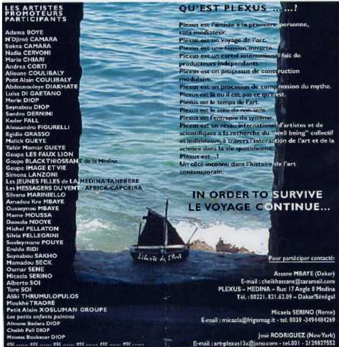
Municipality of Medina, Dakar 2002