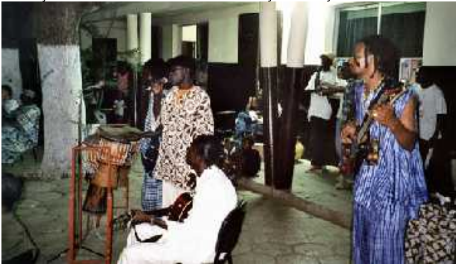
Black Thiossane Group