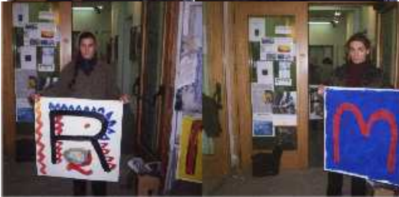
Academy of Fine Arts, Rome 2002