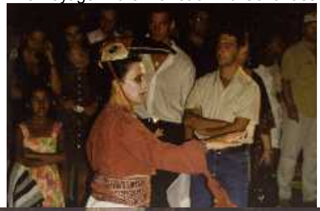
The Voyage in the Planet of Art Continues