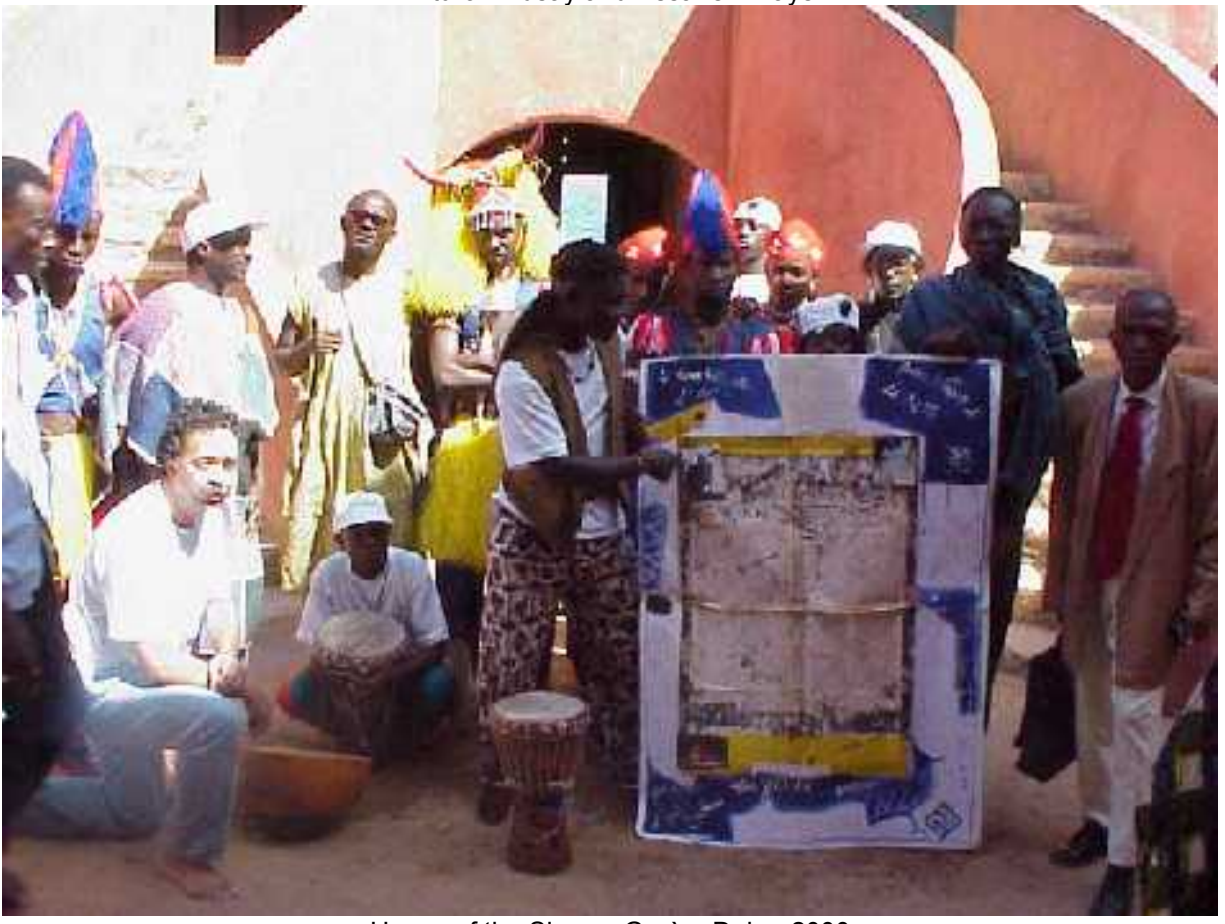
House of the Slaves, Gorèe, Dakar 2000