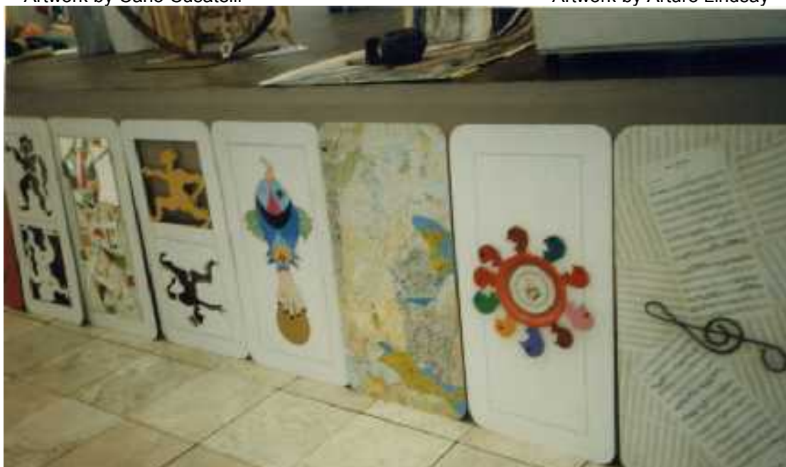
Artworks by Giorgio Fiume, Palazzo dell'Esposizioni, Rome 1996