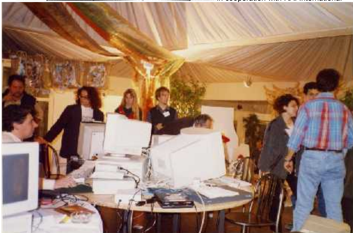
Roof Garden, Palazzo dell'Esposizioni, Rome 1996