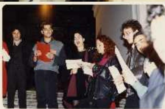
Poetry happening conceived by Giorgio Fiume