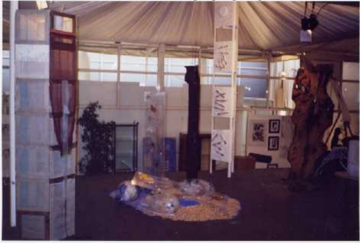
The Ark of the Well Being: Fighting Hunger