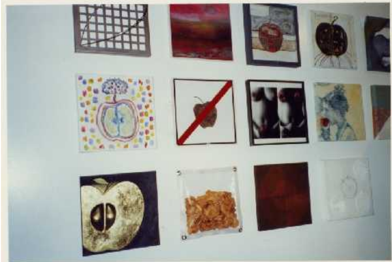
Artshow by Romberg Arte Contemporanea, Palazzo dell'Esposizioni, Rome 1996