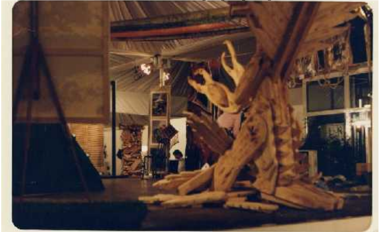
The Ark of the Well Being: Fighting Hunger