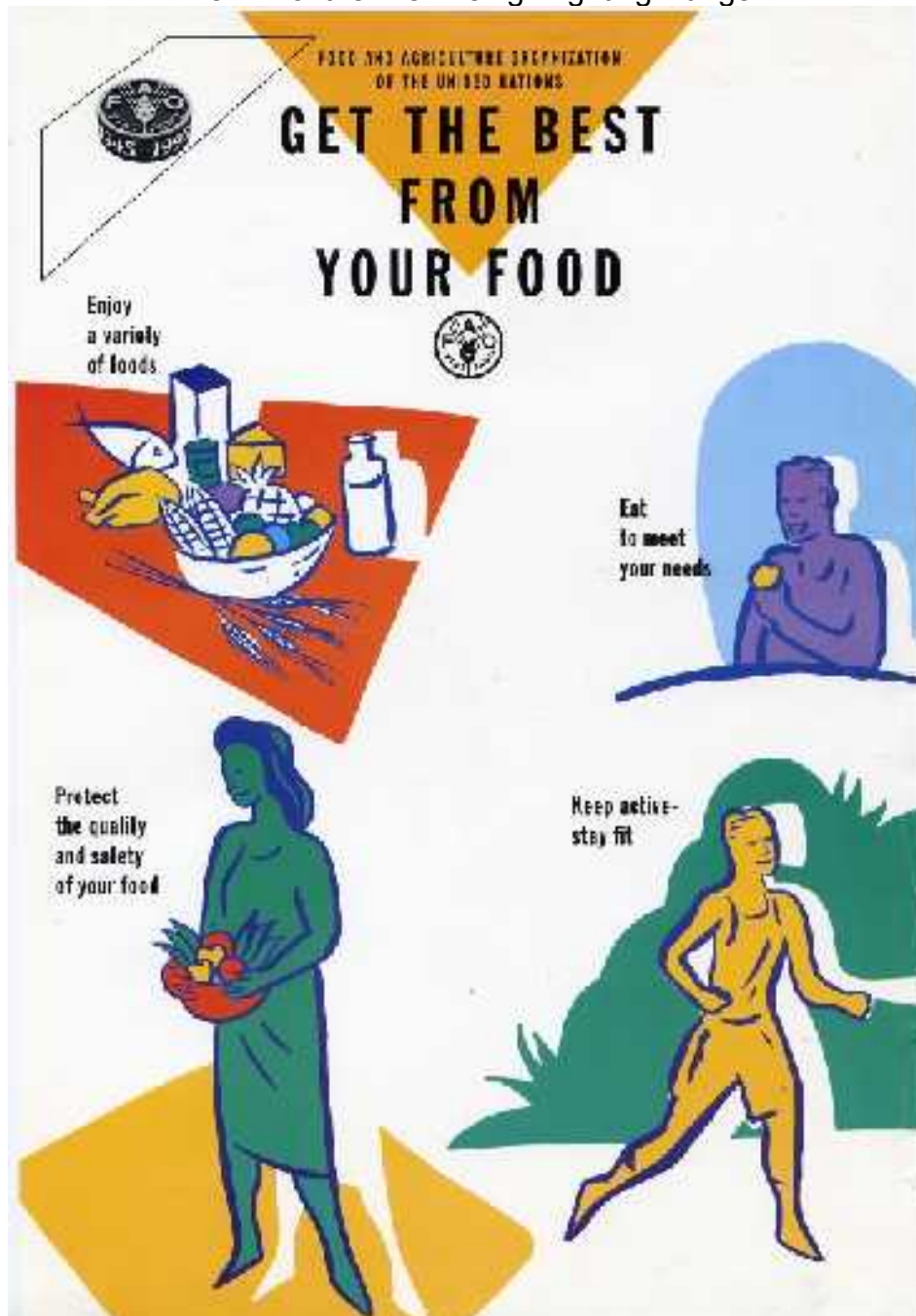
Education Initiative by FAO Food and Nutrition Division