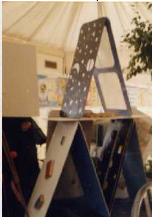
Palazzo dell'Esposizioni, Rome 1996