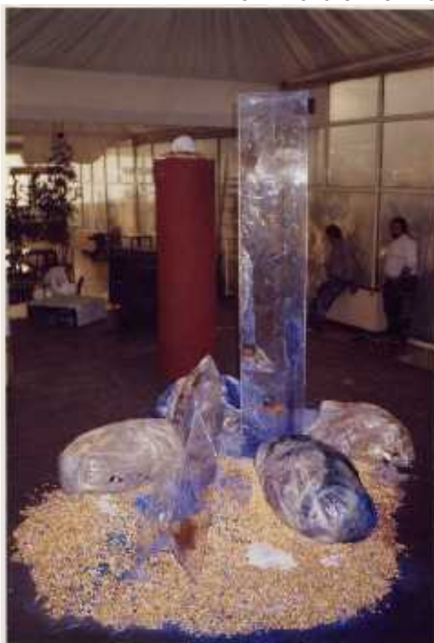
Artwork by Eleonora del Brocco