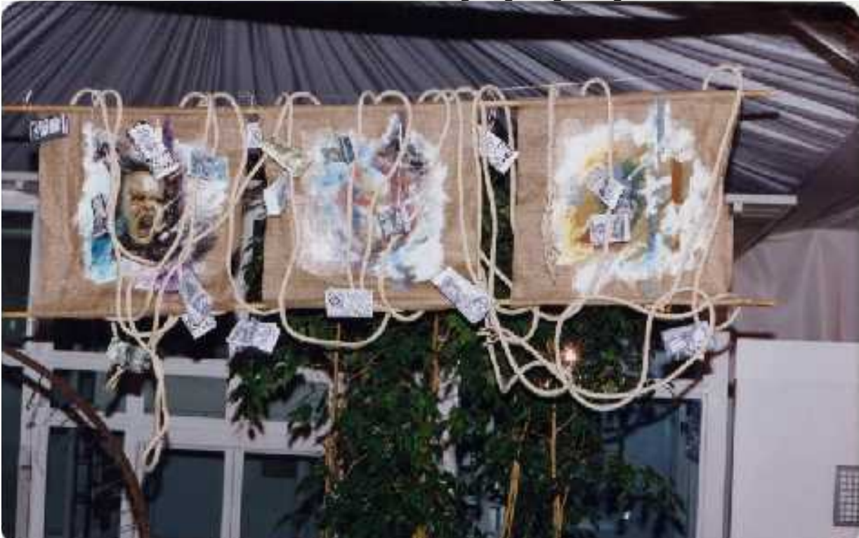
Installation by Micaela Serino, Palazzo delle Esposizioni, Rome 1996