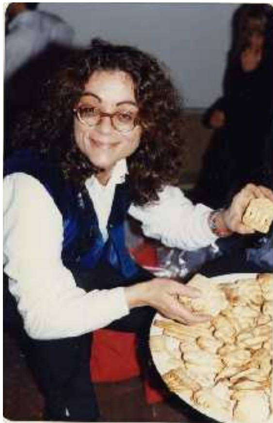
Artwork by Venera Finocchiaro, Palazzo dell'Esposizioni, Rome 1996