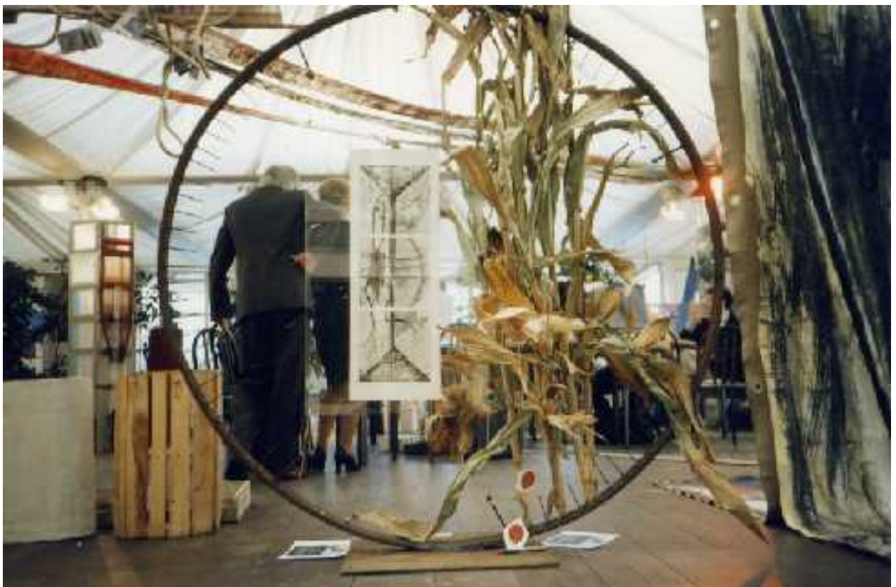
Palazzo dell'Esposizioni, Rome 1996