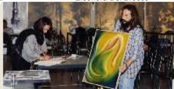
Palazzo dell'Esposizioni, Rome 1996