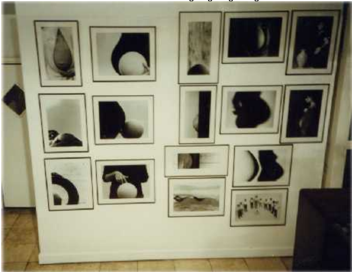
Photo exhibition by Enrica Scalfari, Palazzo dell'Esposizioni, Rome 1996