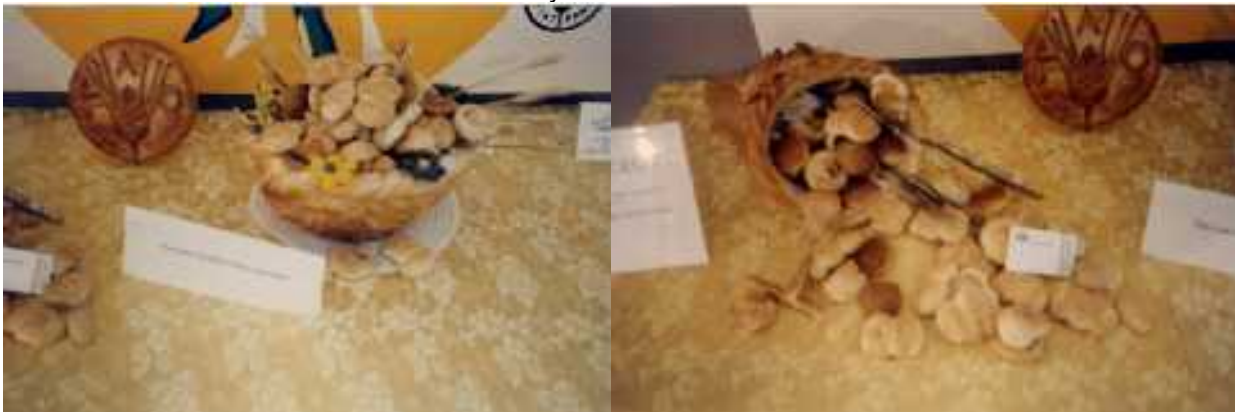
Installation by June Di Schino, Roof Garden, Palazzo dell'Esposizioni, Rome 1996