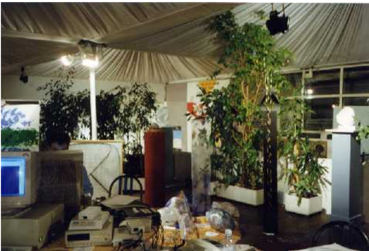
Roof Garden, Palazzo dell'Esposizioni, Rome 1996